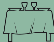
TABLE $10,000 provides 5,319 meals

10 Event tickets with VIP seating • Full page program ad (back cover) • Company logo on website with link • Company name/logo displayed on video screen throughout the event • Social media promotion • Included in pre-event press release • Logo on front of invitation • Stand up card with company ad/logo on each table at event